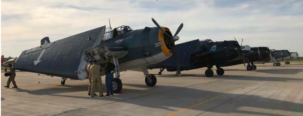
"309" and four of the other 10 TBMs in Peru, IL