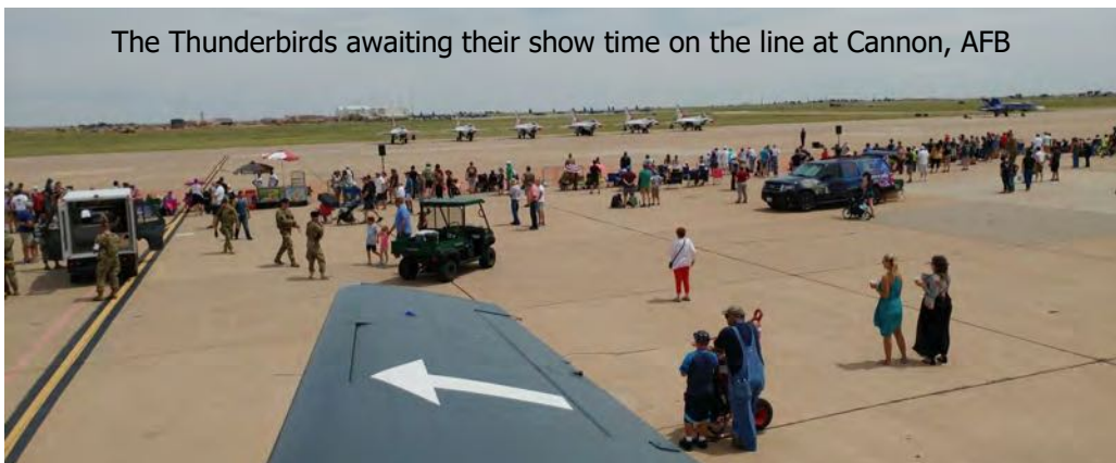
The Thunderbirds awaiting their show time on the line at Cannon, AFB